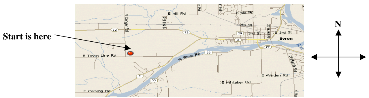
Take IL Route 2 two miles south of Byron, IL to Townline Rd, follow arrows.